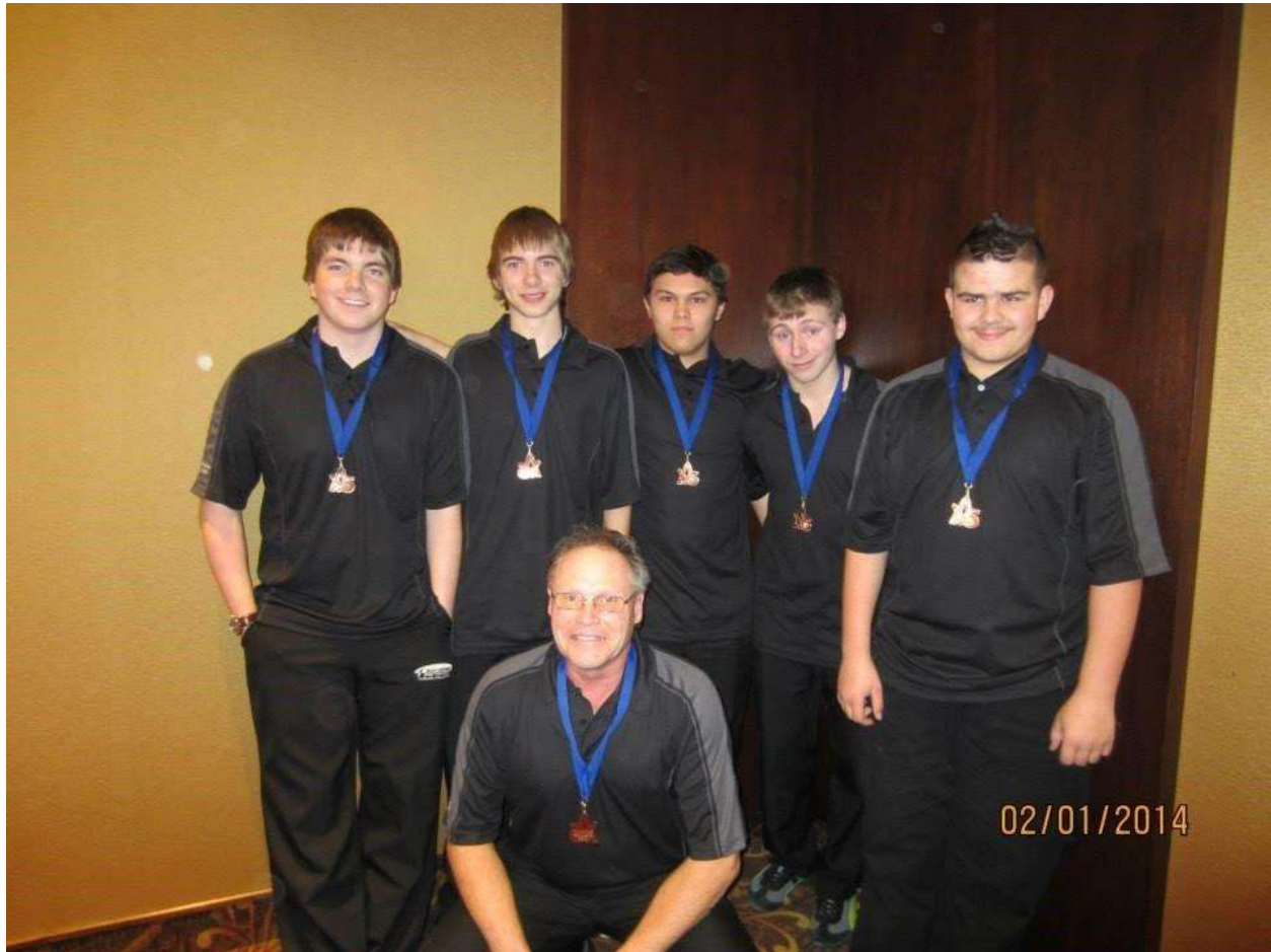
Central Black Team - Bronze Medallist